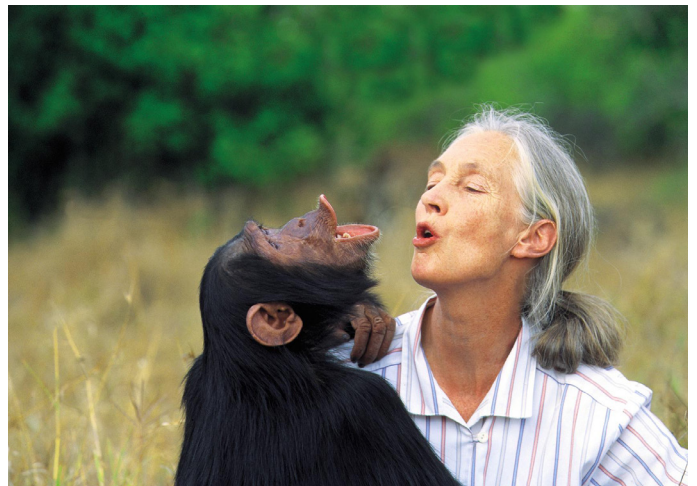
Pant Hoot