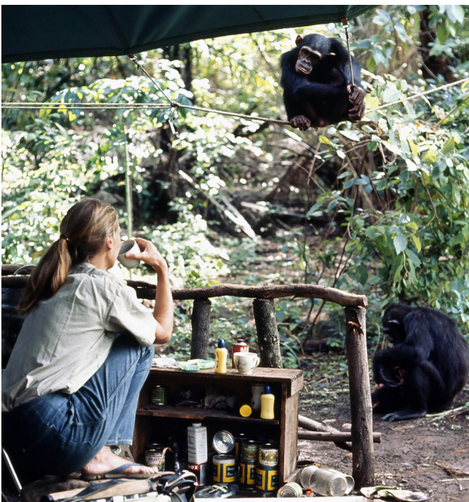
David, Greybeard & Jane, Gombe